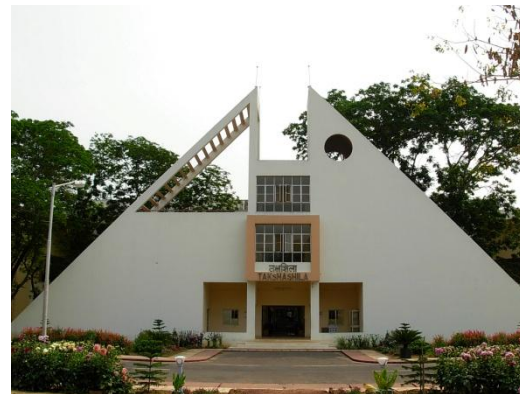
Centre for Educational Technology