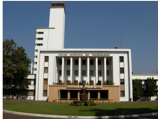
Indian institute of technology Kharagpur

Climate: Winter (October to February) is moderate and pleasant (10 to 25 C) in Kharagpur. Summer (March to June) is hot (25 to 40 C) and sometimes humid. Rains are normally confined to the months of June to September.